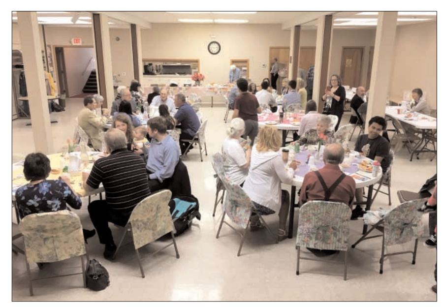
A good crowd enjoyed Resurrection Celebration Easter breakfast and fellowship prior to the service.