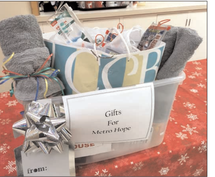
Thank you to all who contributed personal hygiene gifts for Metro Hope Ministries.